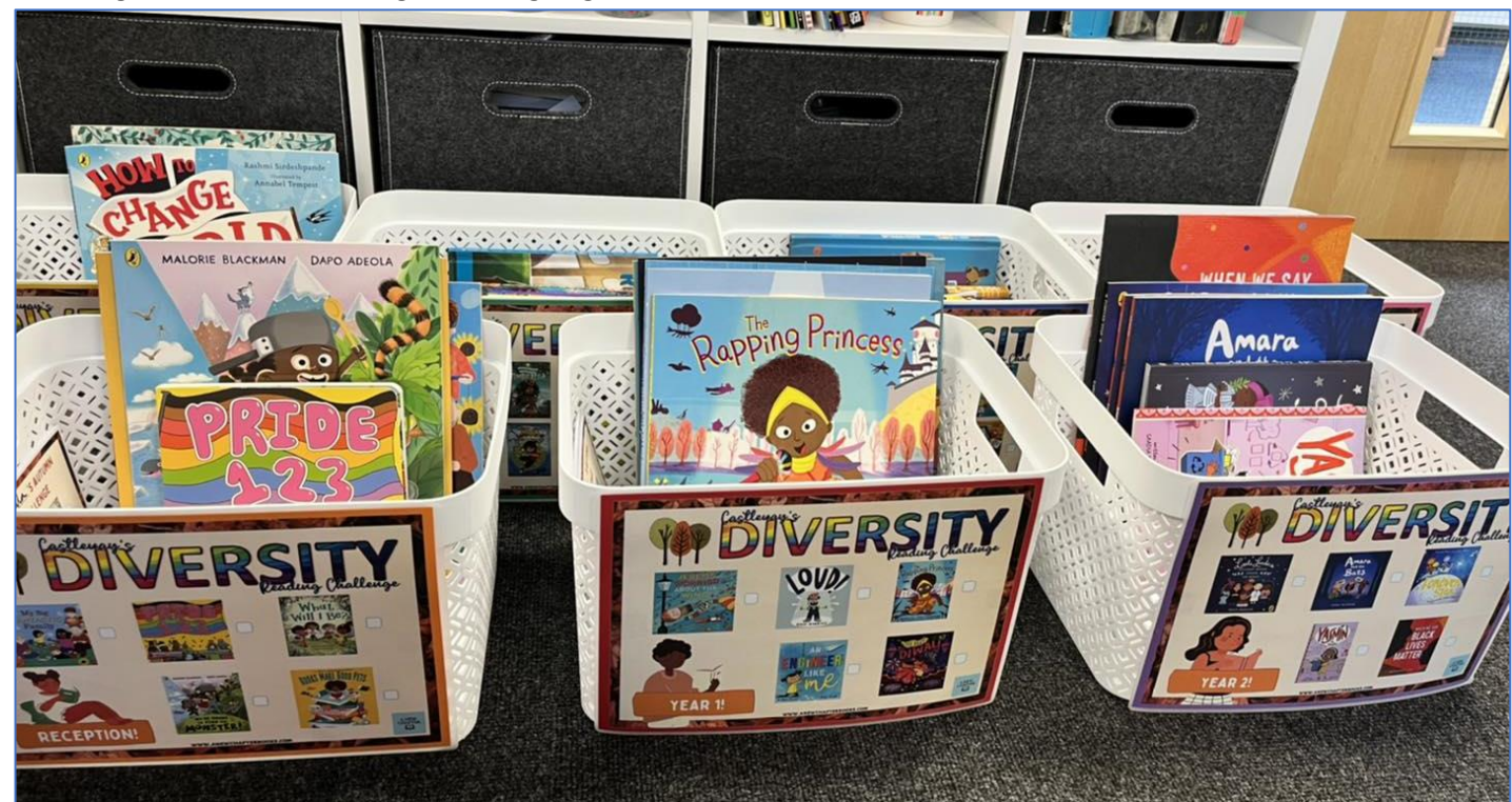
Click on the image to see a video of some of our Year 2 children opening our book delivery!

Speaking of a love of reading, our Diversity Reading Challenge has started again! Remember that each child is challenged to read the 5 books, tick them off their card and record in their reading record. When they've completed their challenge, they'll be presented with one of our special awards in assembly. Just look at the wonderfully diverse books that will be enriching our children's reading diet and going out in to the homes of our families.