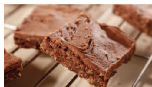
Iced Chocolate Oaty Square