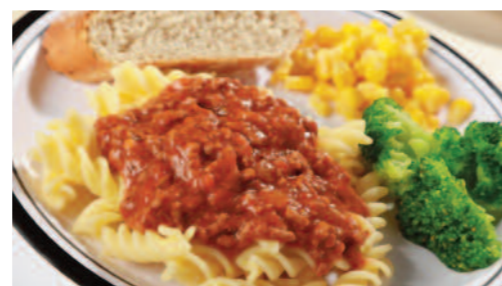
Pasta Bolognese served with Garlic & Herb Bread and Seasonal Vegetables