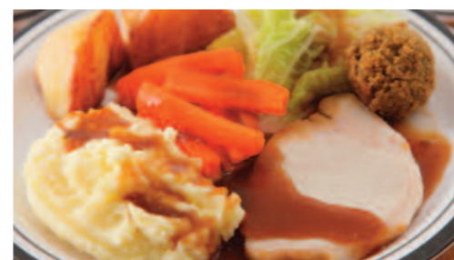
Roast Pork served with Roast/Mashed Potatoes, Seasonal Vegetables & Gravy