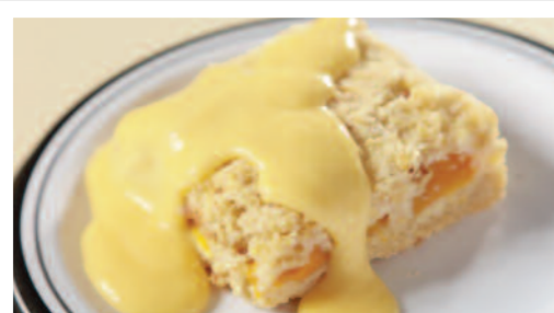
Peach Crumble Slice & Custard