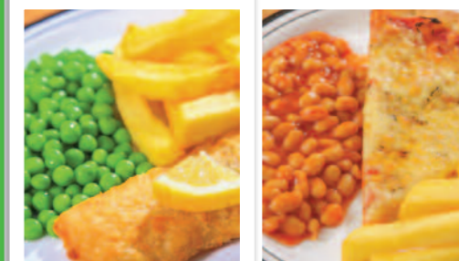
Battered Fish (MSC) or Cheese & Tomato Pizza served with Chips & Peas or Baked Beans

VEGETARIAN VERSION OF THE ABOVE AVAILABLE DAILY