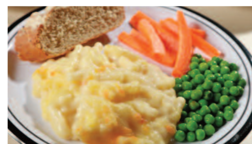
Mac 'n' Cheese served with Garlic & Herb Bread and Seasonal Vegetables