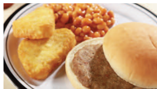
Sausage Pattie in a Bun, Hash Browns and Baked Beans