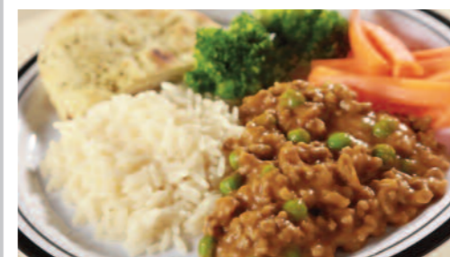
Beef Keema served with Rice, Naan Bread & Seasonal Vegetables