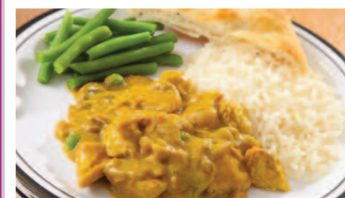
Chinese Chicken Curry served with Rice, Naan Bread & Seasonal Vegetables